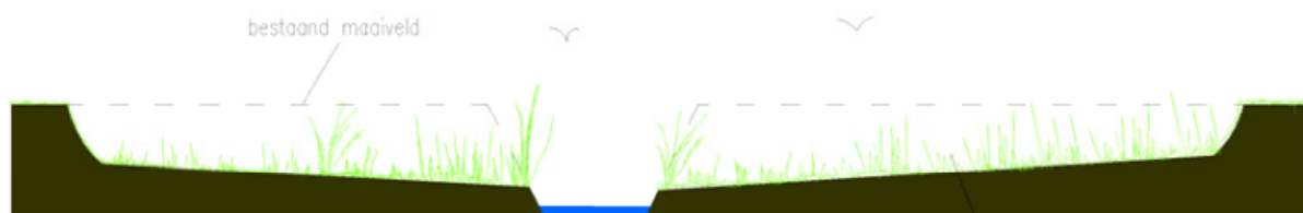
Figure A - 9 Section of a watercourse with eeuwkanthen in Auvergne Polder